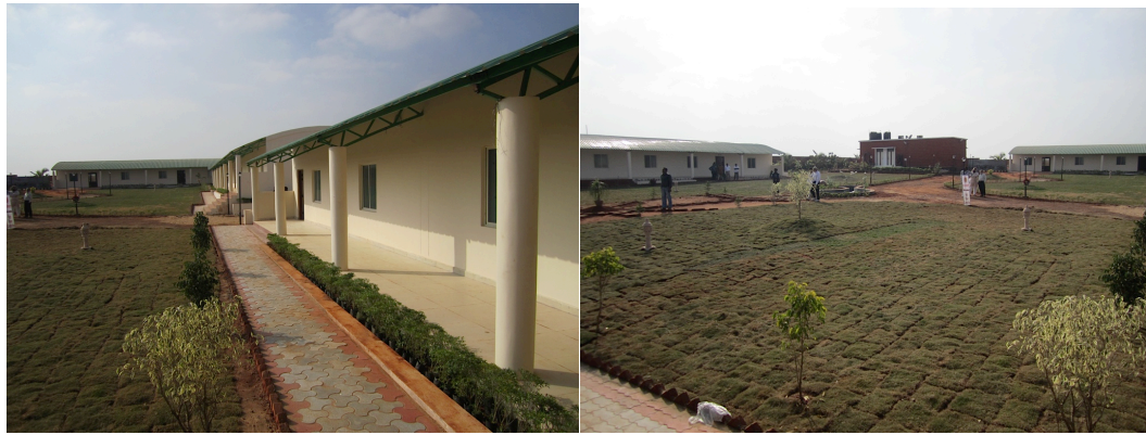
Completion of the SSU Faculty of Management Studies Buildings (2011)