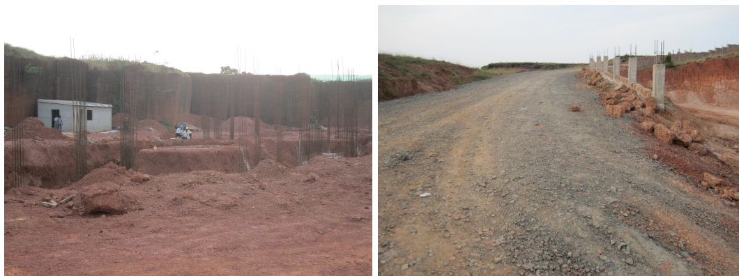
Establishing Infrastructure and Roads on Campus (2011)