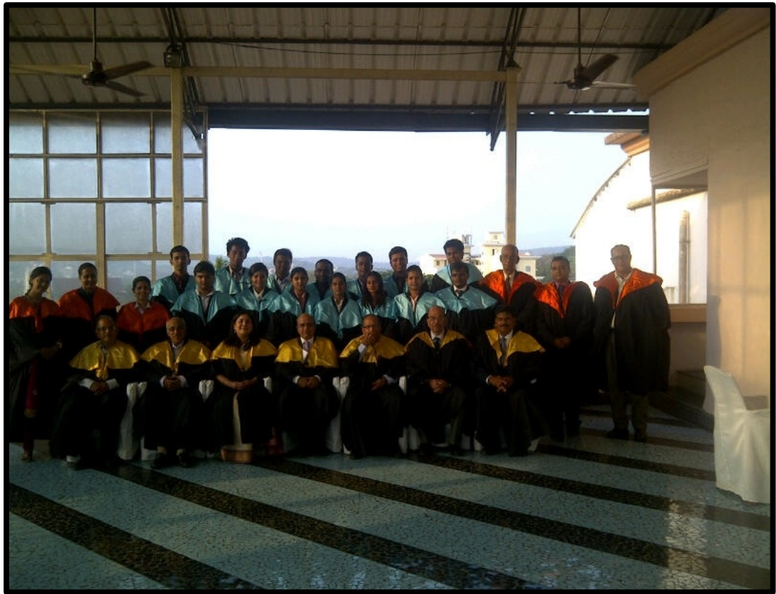
Project Vidya Cohort #3 (2011)