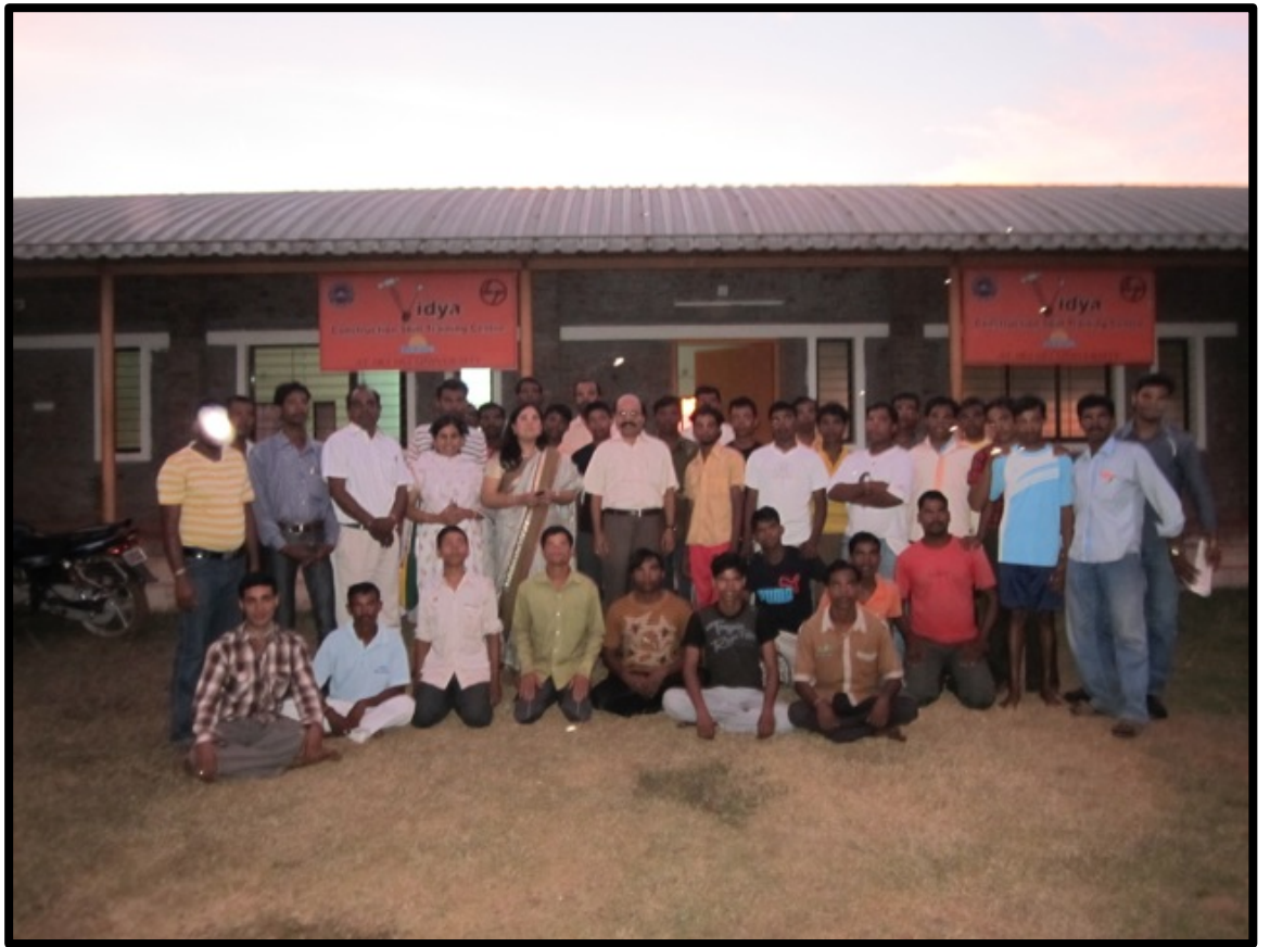
Project Vidya Cohort #1 (2011)