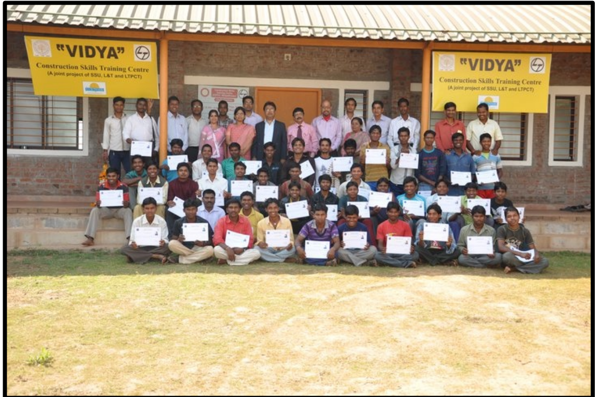
Project Vidya Cohort #2 (2011)