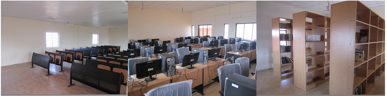
Completion of Early Classrooms, Computer Lab, & Library (2011)