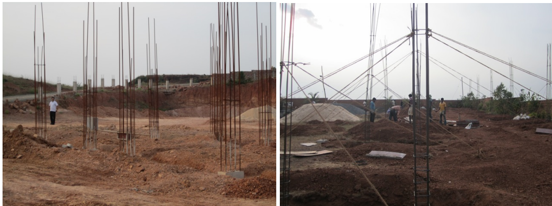
Construction of the SSU Faculty of Management Studies (2011)