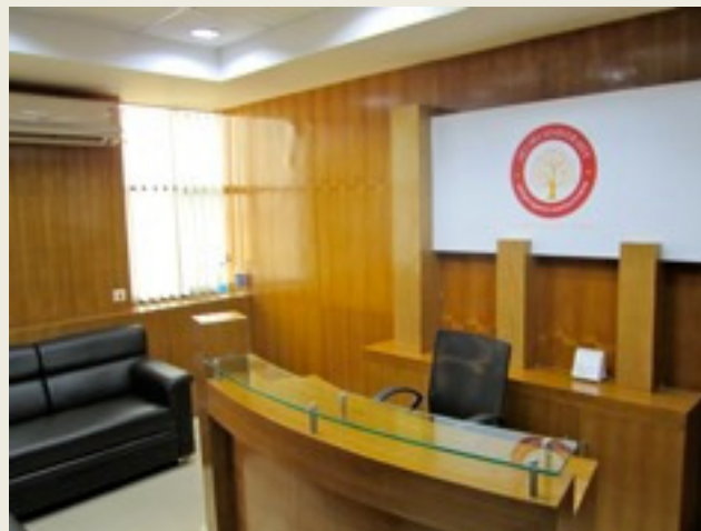
Sri Sri University Office in Bhubaneswar