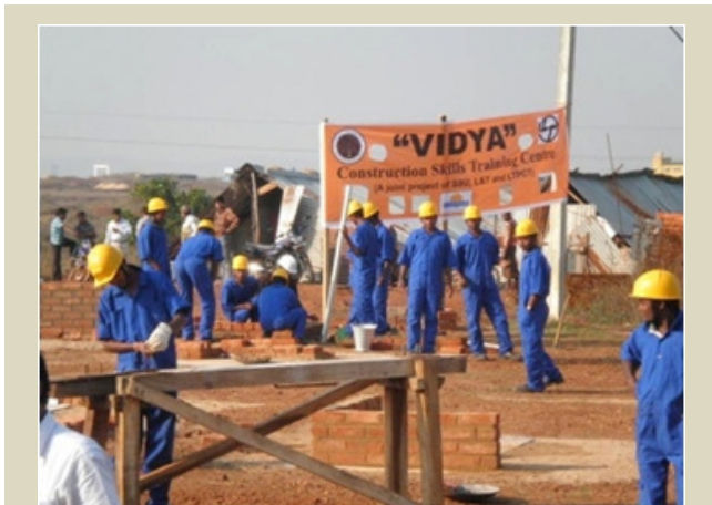
Training in Masonry

In a pilot program called Project Vidya, forty-one rural youth underwent three months of training in masonry and metalworking. In 2010, SSU signed a formal memo of understanding with L&T Public Charitable Trust and L&T Construction & Skills Training Institute to set up a training center in Orissa under the banner of Sri Sri University. This joint venture provides free services that include construction skills training, boarding and lodging, and also imparts Art of Living techniques that encourage sound physical & mental well-being.